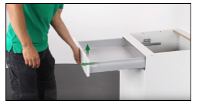
STEP 3 Maintain upward pressure as you reach full extension.