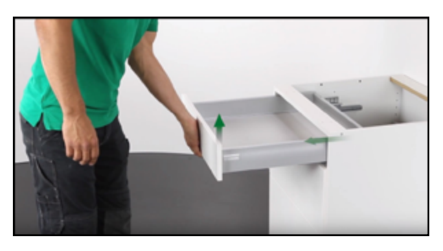
STEP 2 Apply gentle upward pressure as you begin to fully extend the drawer.