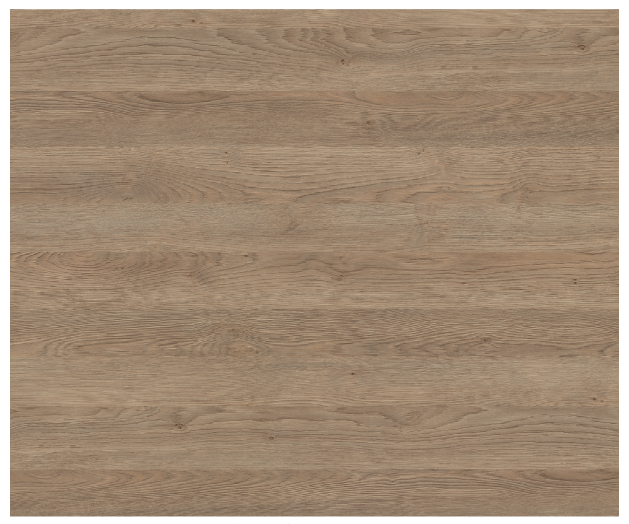
EGGER | H3326 ST28 | GREY BEIGE GLADSTONE OAK