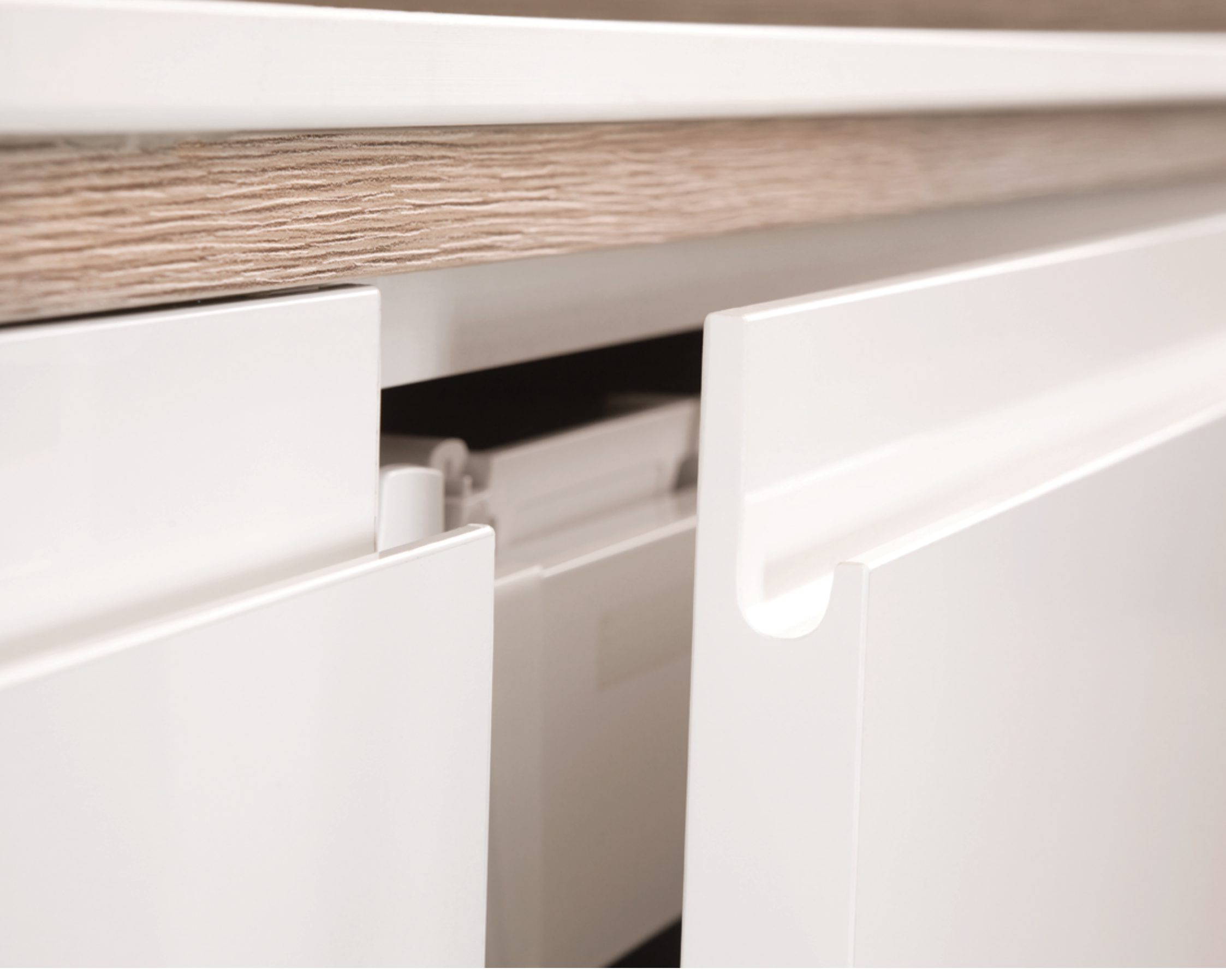
Premium White HG, manufactured 22 mm J-Handle.