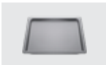
Enameled baking tray

Nikpol | 1300 645 765 | www.nikpol.com.au | sales@nikpol.com.au